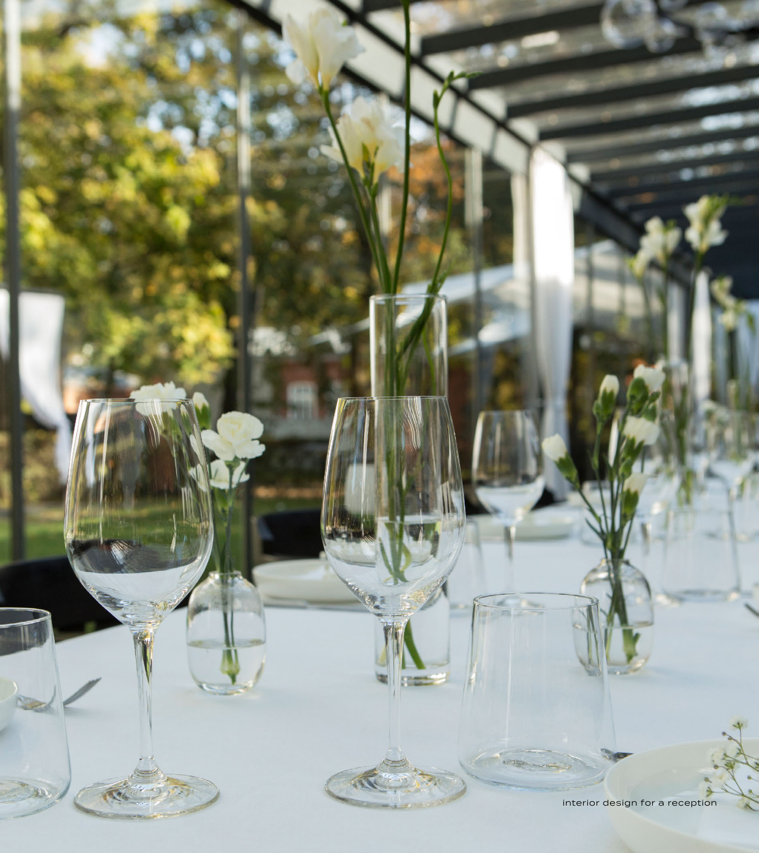
interior design for a reception