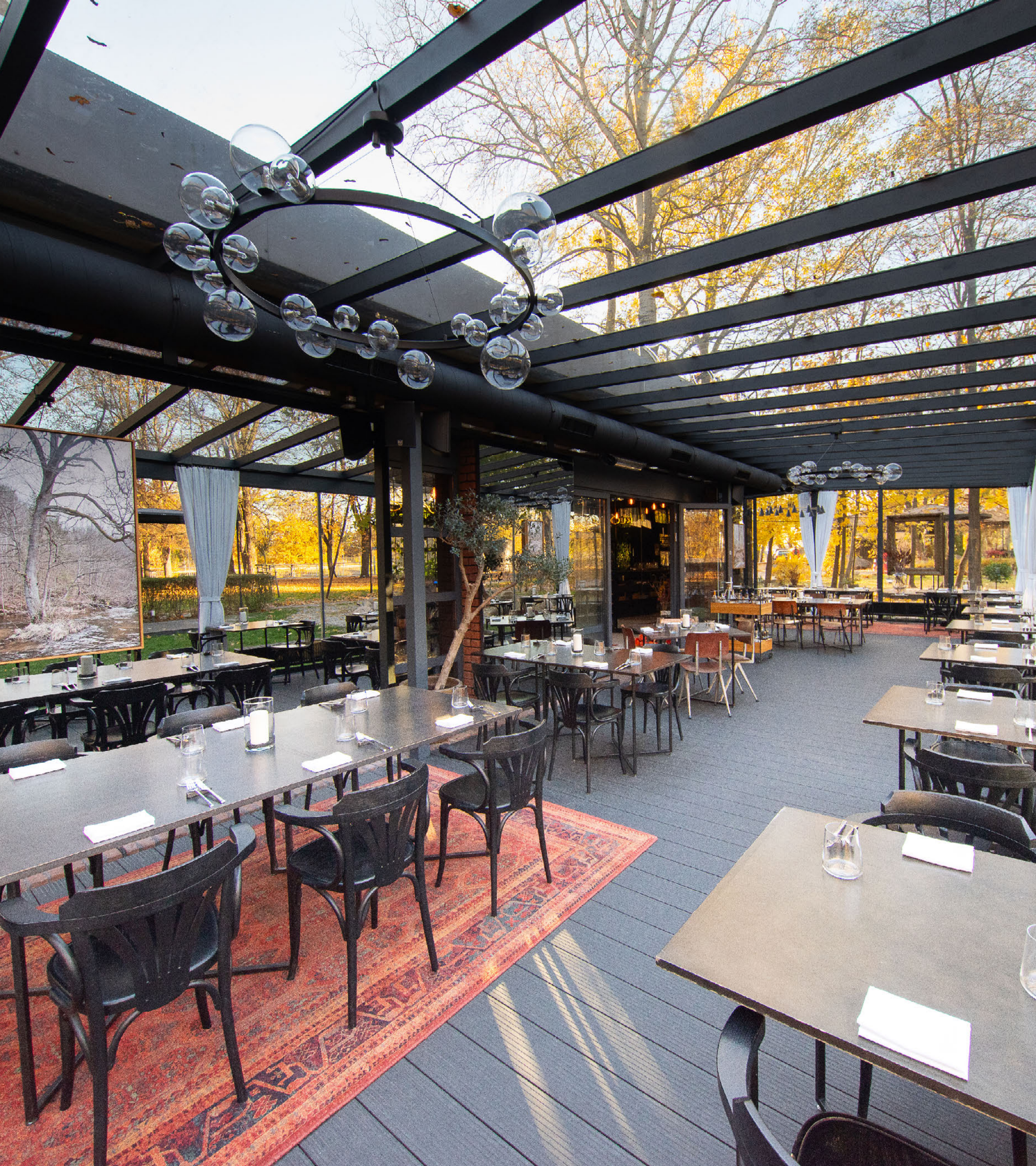
the outdoor hall and garden