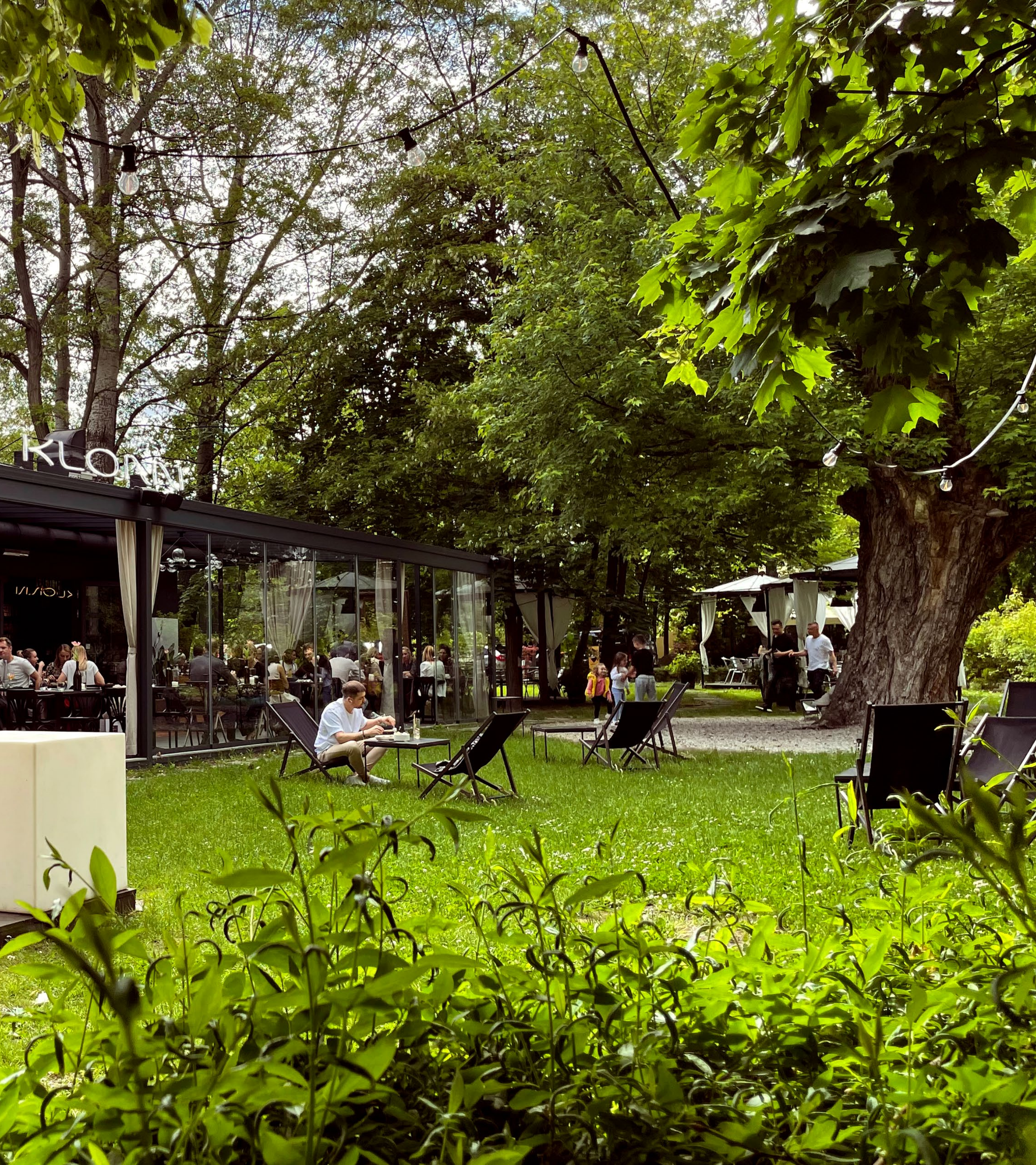
the outdoor hall and garden